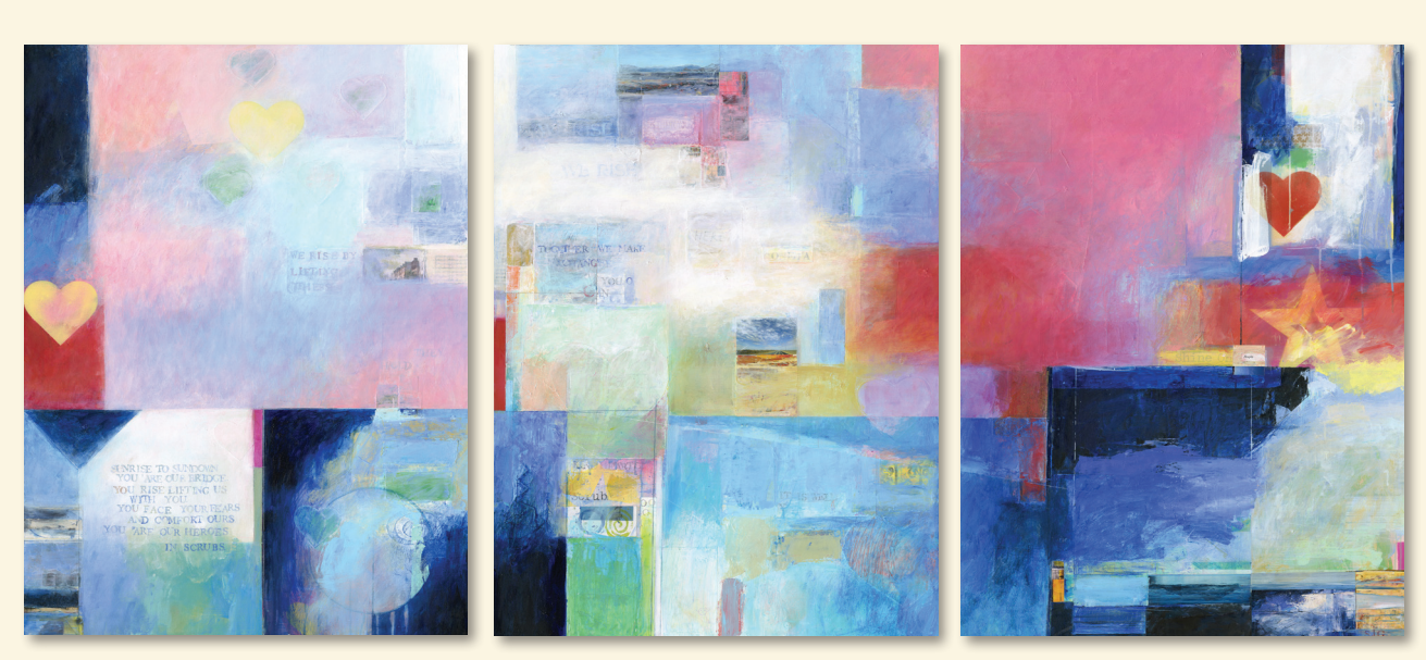
Left to right: "Morning Light," "Midday Light" and "Sundown Light," the three canvases that comprise a new art installation for Penn Medicine Lancaster General Health, created in tribute to the health care heroes and patients of the COVID-19 pandemic.

Throughout the pandemic, colorful paper hearts and stars welcomed Penn Medicine Lancaster General Health employees and visitors as they crossed the windowed corridor connecting the Downtown Pavilion to Lancaster General Hospital.